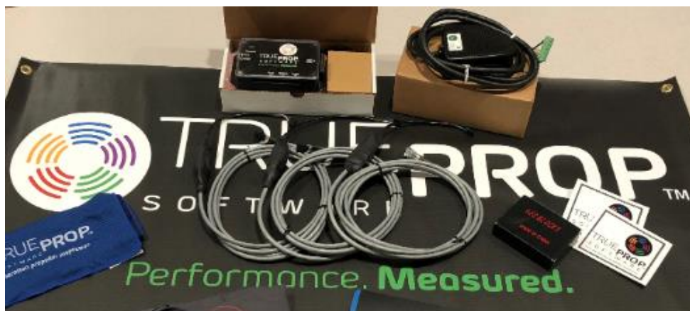
Figure 1 - TrueProp hardware connection kit for Prop View 3.

So how are we doing this? Because TrueProp allows you to repurpose your existing propeller measurement equipment. For commercial devices such as MRI, Prop Scan, Prop View, and BladeRunner, TrueProp offers hardware connection kits to make running TrueProp Software simple and effortless!